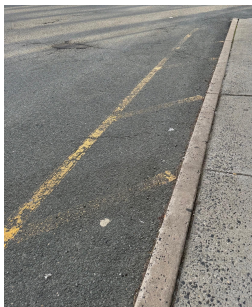
Non-Compliant Fire Lane